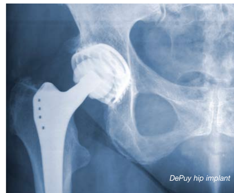
DePuy hip implant